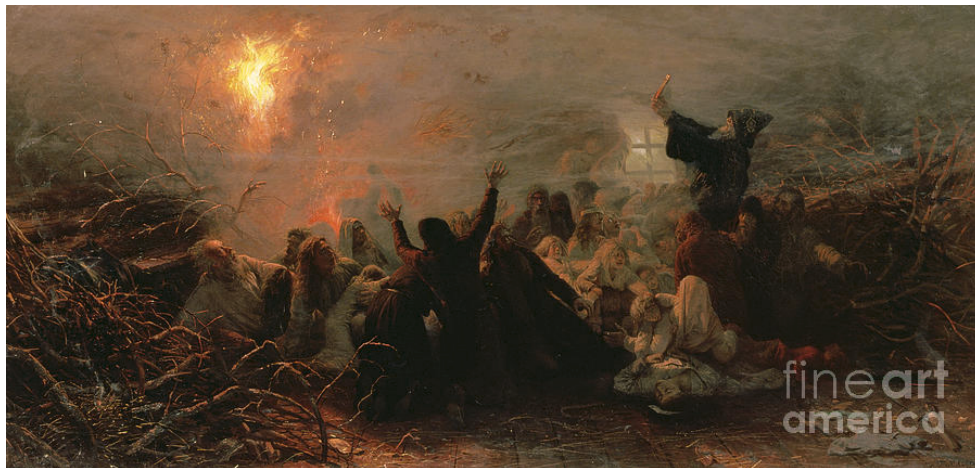
Self-Immolation (1884). Grigori Grigorievich Mjasoedov

The darkly tenacious and startlingly violent Israeli-Hamas conflict rightly continues to receive much historical and political comment and analysis. Less considered though, are the generating psychological hungers and anxieties that lie deep beneath.