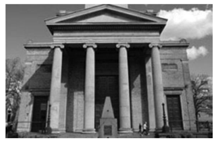
Location and vocation – some grand entrances: St James Church, Bermondsey (Home to the author's NHS surgery for nearly three decades)

For thirty years, my unusual practice had operated out of a rented section of an active 1830 church in Bermondsey, south London, UK. It had been exceptionally and consistently popular with patients and staff. There was no