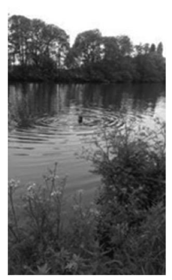
Crossing the Rubicon: the author swimming in the Thames after work

"We have rules and regulations designed to ensure good safety and probity. We expect evidence of compliance with these. Failure to demonstrate this to our satisfaction thus becomes a definition of errant and outlawed practice. This GP practice failed to comply, is therefore unsafe, and must be closed forthwith." [CQC – 11 July 2016]